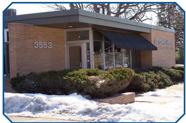
3553 Hennepin Ave. in 2020.

Following the 1955 convention, the board of directors through the District's stewardship committee created a District office committee. This committee then set to work identifying properties that would be suitable to serve as the Minnesota District office. The committee researched both existing properties and the possibility of a new building. One of the new building options considered was building on the campus of Concordia University, St. Paul. 39