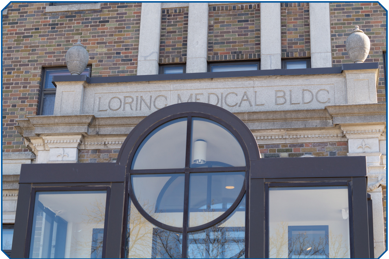
Loring Medical Building in 2020.

This discussion began in earnest in October 1945 when the board of directors resolved to appoint an official committee “to gather facts regarding the establishment of a centralized Minnesota District Office.” 25 This committee located offices that could accommodate all of the District workers. On November 20, 1946, the board of directors resolved to sign a three-year lease for two offices, 400 and 402 of the Loring Medical Building at 1409 Willow St., Minneapolis, Minn. The cost of the lease was reported as $130 per month. 26