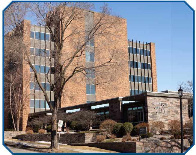
Protestant Center (now the Minnesota Church Center) in 2020.

As the story is told in the board of directors minutes, things were quietly progressing through 1961 and 1962 while construction proceeded on the Protestant Center. However, it is clear that sometime in the summer or early fall of 1962, doubts began to form about whether or not the Protestant Center was going to be completed. In the Nov. 20, 1962, board of directors meeting, the custodial committee, having lost faith in the project, recommended a complete reversal to be presented to the January 1963 District convention. 56