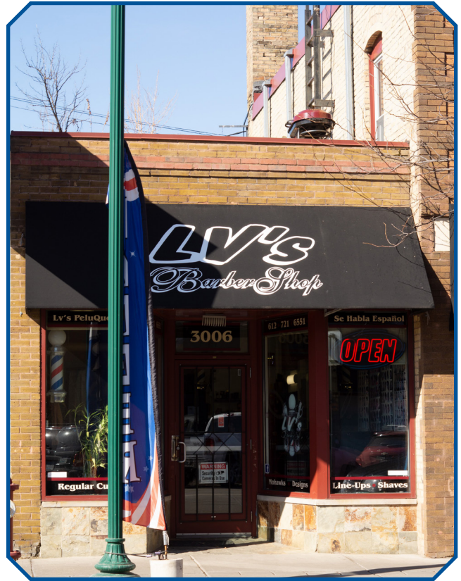
3006 27th Ave. S in 2020.