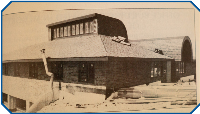
14301 Grand Ave. S as it neared completion in July 1983, as pictured in the October / November 1983 Minnesota South Lutheran .