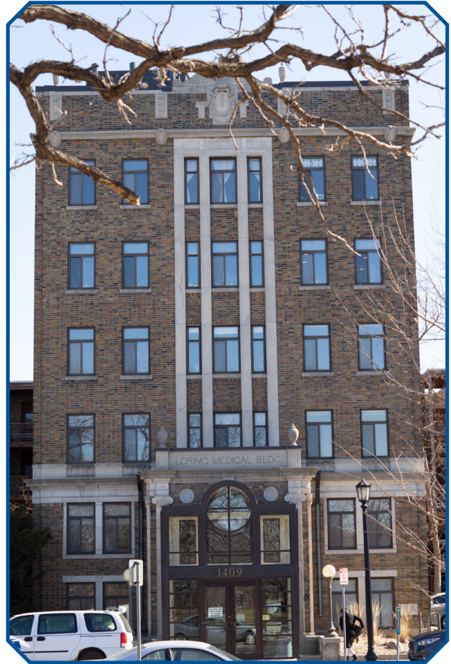
Loring Medical Building in 2020.