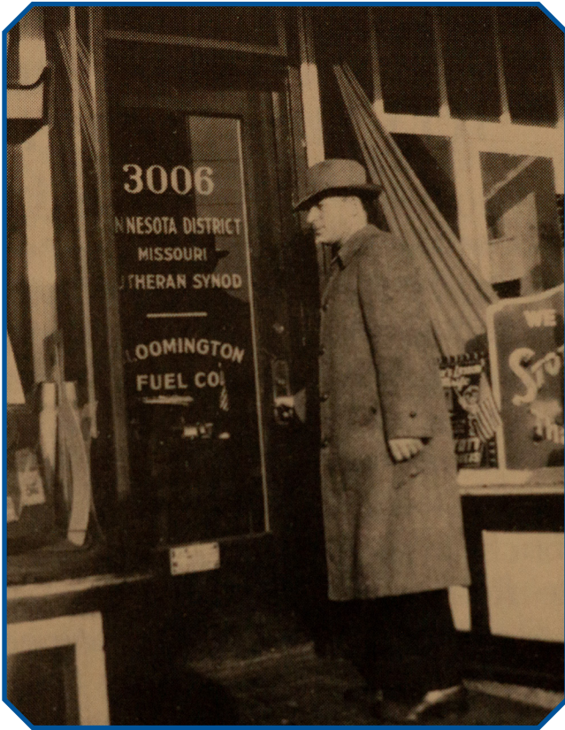
3006 27th Ave. S as pictured in November / December 1983 Minnesota South Lutheran , year unknown.