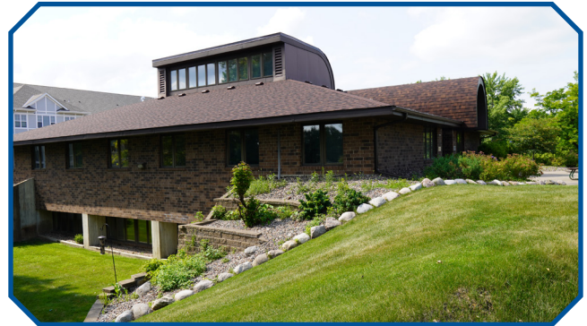
14301 Grand Ave. S in 2021.

After the committee had done its research, they recommended that the best site would be the property in Burnsville adjacent to Redeemer Lutheran Church. 84,85 In April 1981, the board was moving to hire an architect to prepare a model for the proposed office. 86 In October, the purchase of the parcel of property adjacent to Redeemer was moving forward; a new committee to work with the architect on space needs, site evaluation, and preliminary drawings was created; and it was moved that drawings and costs be prepared and approved by the board to submit to the 1982 District convention for final approval. 87 By June 1982, the purchase agreement with Redeemer was being finalized, and the final plans were being approved and moving into construction drawings, with financing being decided in August right before the convention. 88