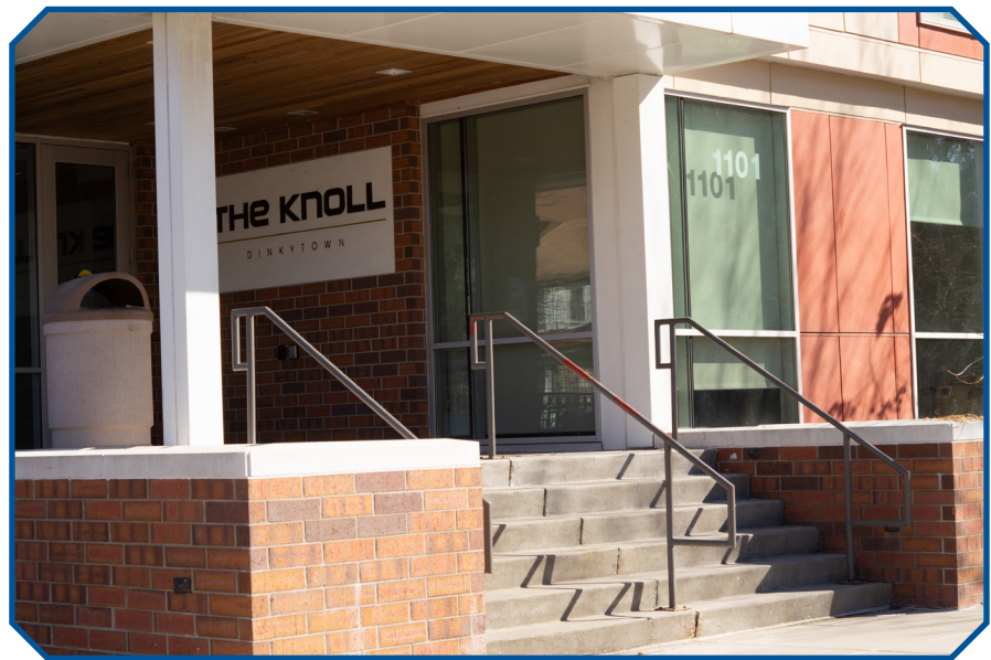
Off-campus student apartments near the University of Minnesota in 2020, where the Lutheran Student Center previously stood.

The first WHEREAS of the initial resolution that was voted down says, “The Need for permanent District Offices has been the serious concern of the Minnesota District for a number of years.” 38 The sources do not seem to directly indicate what the “serious concern” was; however, this telling phrase indicates, at least, that the previous two office spaces and the present one were not adequate for the Minnesota District to administer its home mission efforts and its commitments to the general Synod.