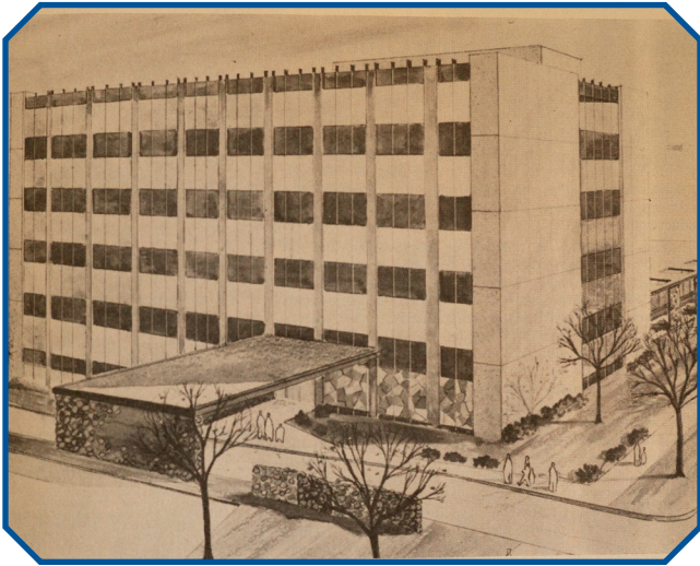
Protestant Center as pictured in the October 1963 Minnesota South Lutheran .