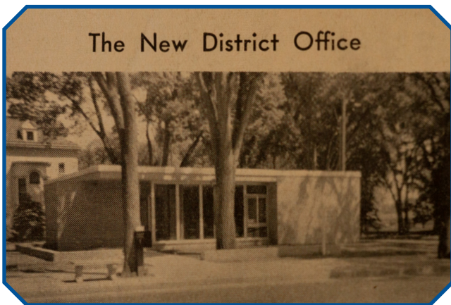
3553 Hennepin Ave. as pictured in the October 1956 Minnesota South Lutheran .