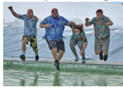
Omega Plunge • Feb. 25

Get your team ready for the Omega Plunge, to be held for the first time at Camp Omega. For over five years, the plunge has averaged 20 teams per year. Teams can be one person or groups of many. Youth groups make great teams! To make it even more fun, teams are encouraged to dress in a theme for the big event. Funds raised will support the Camp Omega Adult and Family Retreat Center Building Fund. If you have ever thought about plunging, this is the year! Visit campomega.org/event/polar-plunge-2.