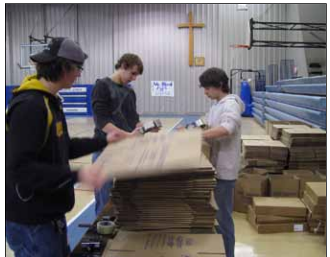
Martin Luther High School students prepare boxes for packing.

This servant event was a testimony to the God these students serve and learn about everyday in their Lutheran schools. For more information, go to www.martinlutherhs.com .